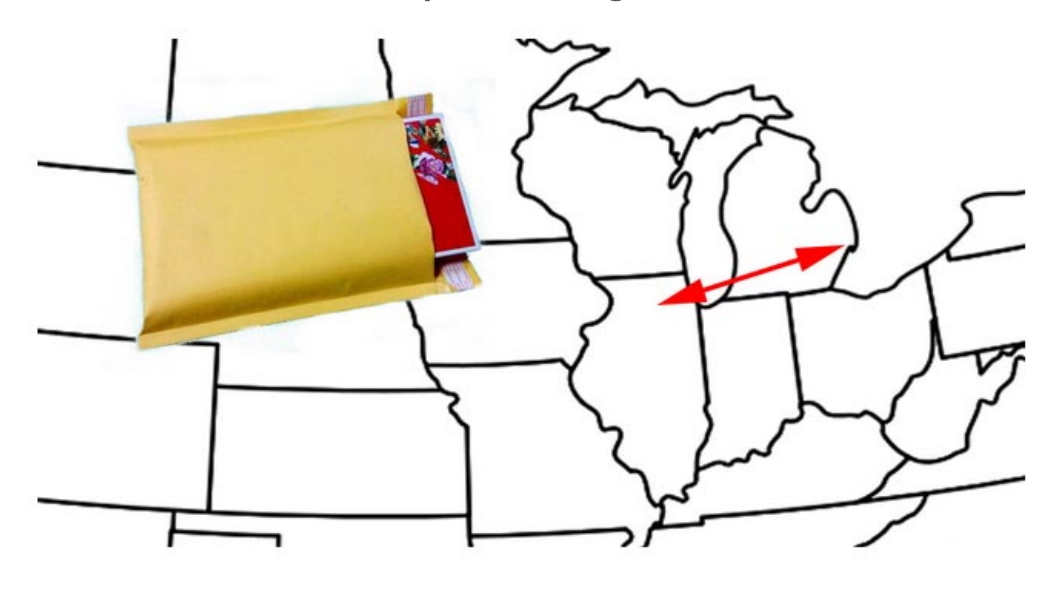
3 lb Envelope from Chicago to Detroit