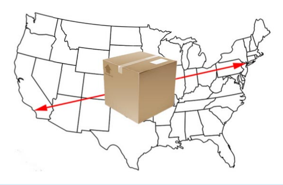
10 lb Package from New York to California